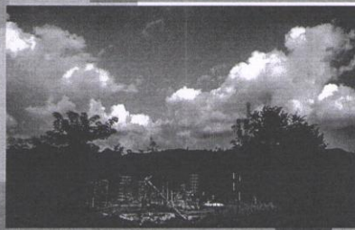
University of Westminster Trophy work.