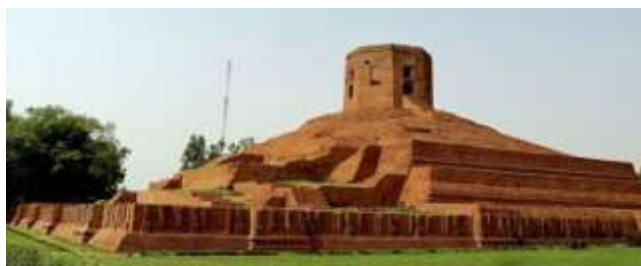
A STUPA- AN ARCHAEOLOGICAL SOURCE